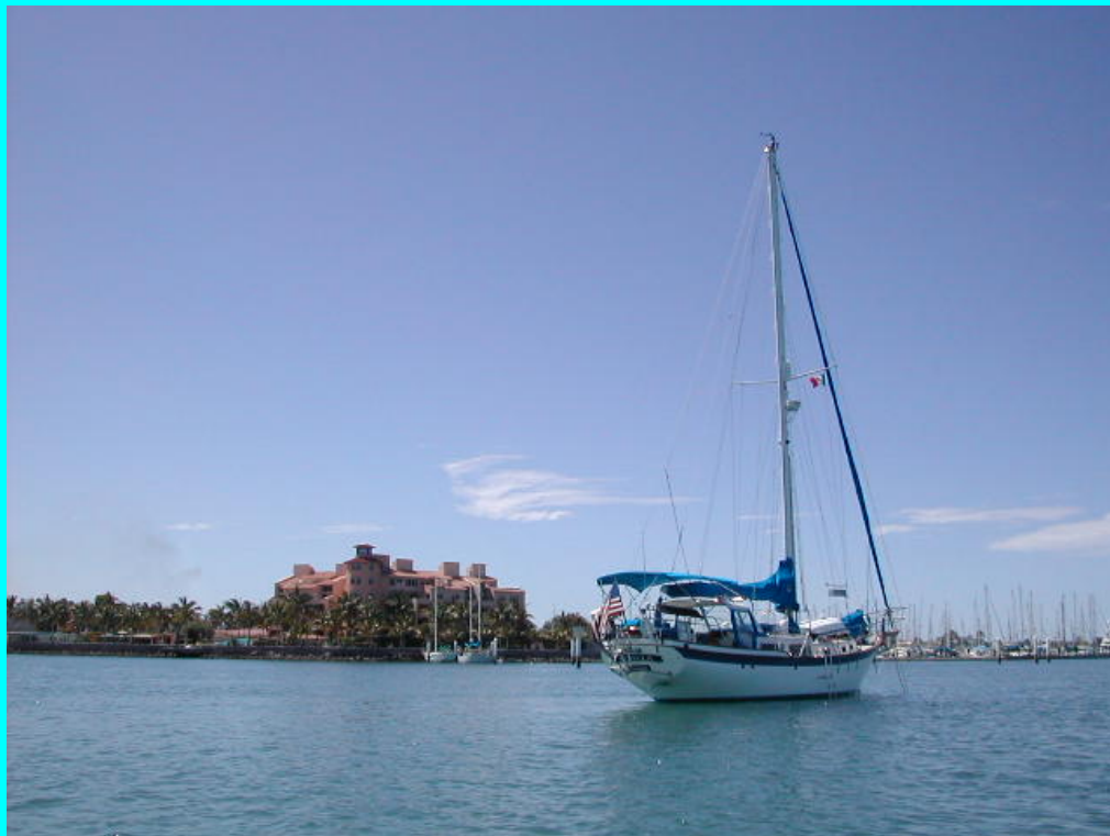
Kuhela anchored at La Paz

We anchored for two nights in the bay at La Paz and are presently moored at Marina de La Paz. Our present plan is to depart La Paz on Tuesday, March 18, headed out first to the nearby islands – then north to a few other islands – before sailing across the Sea of Cortez to Matzatlan, arriving there on or before the first of April.